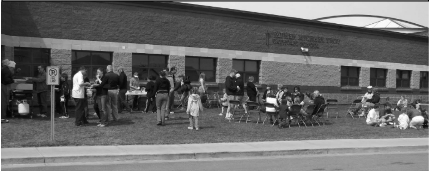
More than 100 residents participated in this year's spring clean up in our community, making it one of the best clean ups ever. Christ's Church of the Meadows provided at least 30 volunteers and graciously hosted a barbeque at Father Michael Troy School for all the participants who also received $10 vouchers from Mill Woods Town Centre.